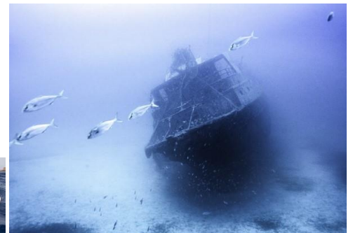
Erwin Rauscher: Langer Tag der Flucht. 6. Okt. 2023