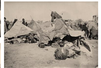
The Armenian Genocide 1915