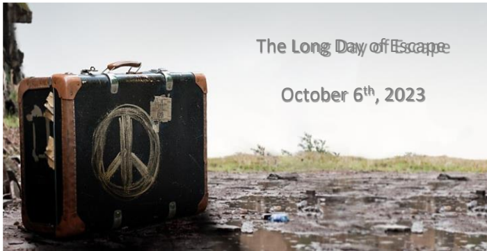
Erwin Rauscher: Langer Tag der Flucht. 6. Okt. 2023