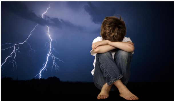
Erwin Rauscher: Langer Tag der Flucht. 6. Okt. 2023

I hope that this event will not be a cozy discussion between do-gooders, but will have consequences that will actually have an impact on our education system. The diversity of our migration society requires a changed understanding of education and structures geared towards it. Integration as a school approach to migration is both a social requirement and an individual effort; there is no alternative to it.